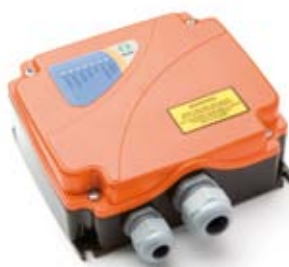
>>> R70MP10 Receiver